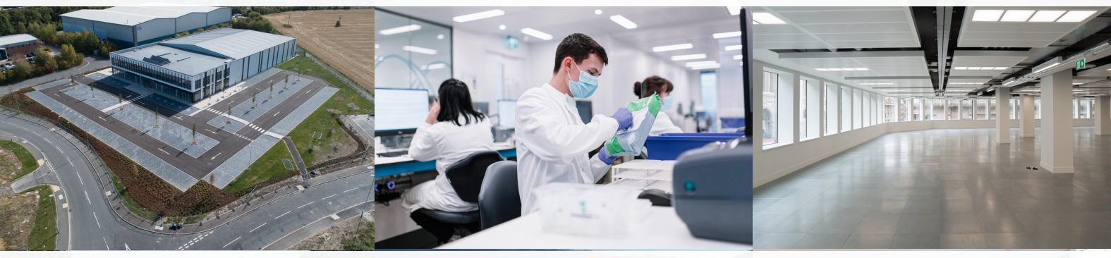
Public Sector & Local Government